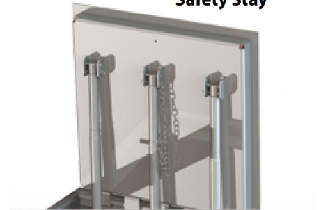
Standard Safety Stay

Specify: Kent Hinged Solo Chequer Manhole KHSCHQ-600/600; 600mm x 600mm clear opening; 80mm Tray Depth; Unsealed; Grade 316L Stainless Steel; Loading FACTA B