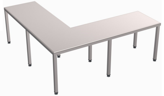
Corner Sections Available (1300x1300mm)