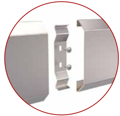
Join Fixing Detail