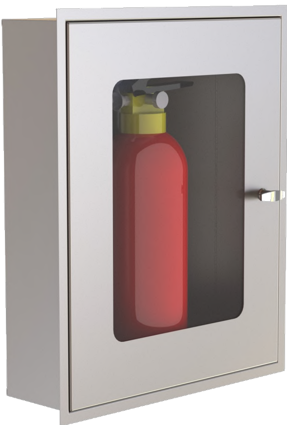
Kent Recessed Fire Extinguisher Cabinet