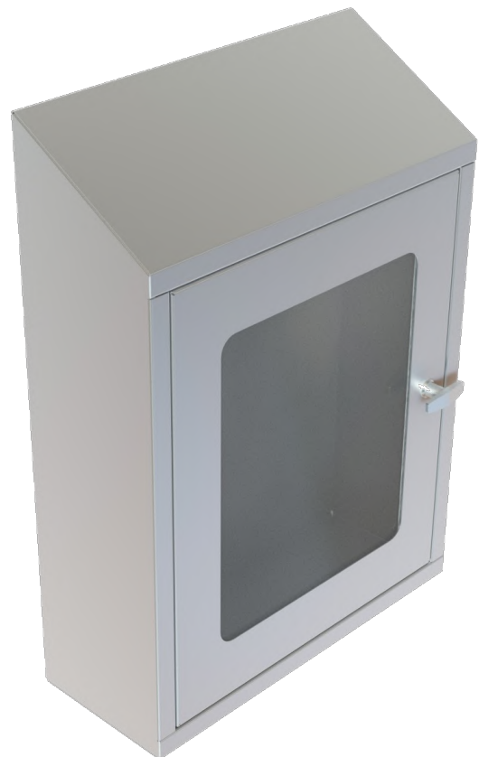
Kent Free Standing Fire Extinguisher Cabinet