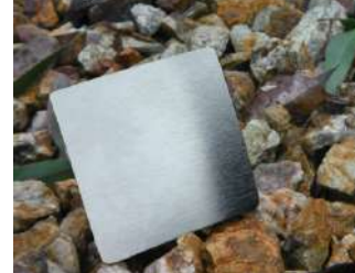
Cold Rolled Electropolished