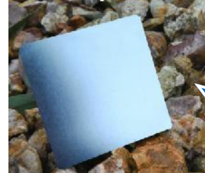
Satin Finish 320 Grit Polished