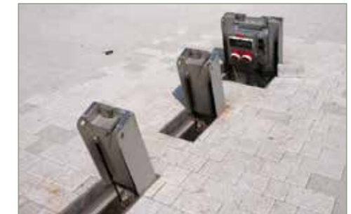
Commonly made as part of a triple unit including Power, Potable Water Supply and Grey Water Outlet