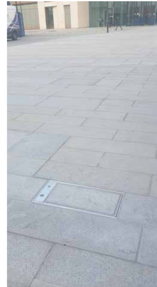
Food Carts use this box for Emptying Coffee and other Liquid Waste Tidily during the day.