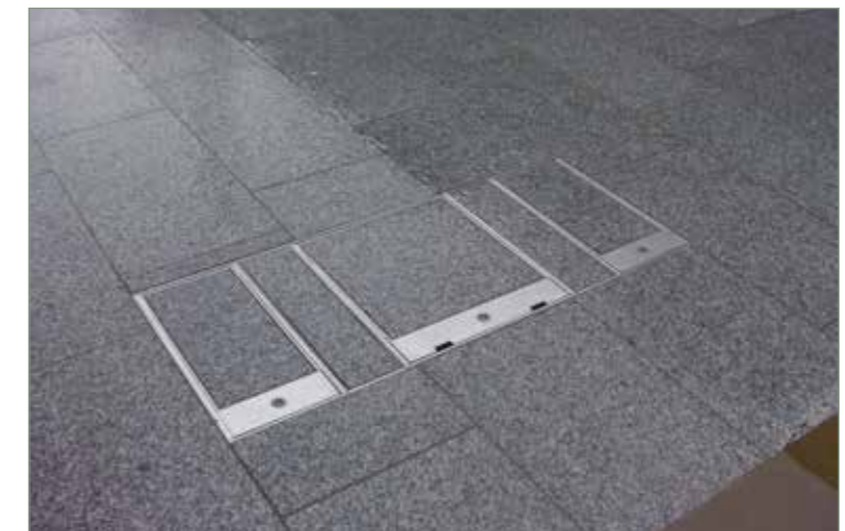
Food Trucks use this box to Refill their Potable Water Tank during the day to make their Coffee/Tea & Wash Up.