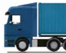
44 Ton Truck FACTA B Loading EN124 B125 Loading

Specify Kent KIGPWU– Type 9 Potable Water Unit; 300mm x 600mm top; with a 450mm depth; Grade 316 Stainless Steel; Loading FACTA B; With Bib Tap, With 110mm bottom drainage outlet