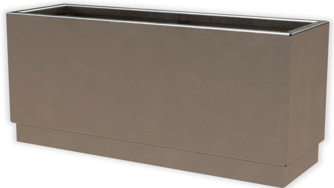
Tiger Bronze Steel Finish