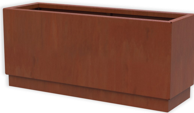
Imitation Corten Steel Finish