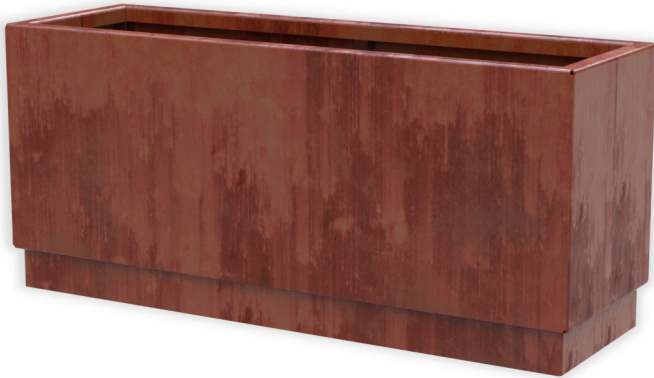
Corten Steel Finish