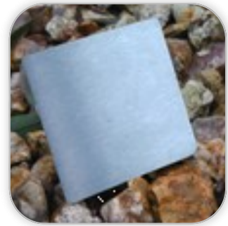
Satin Finish 320 Grit Polished