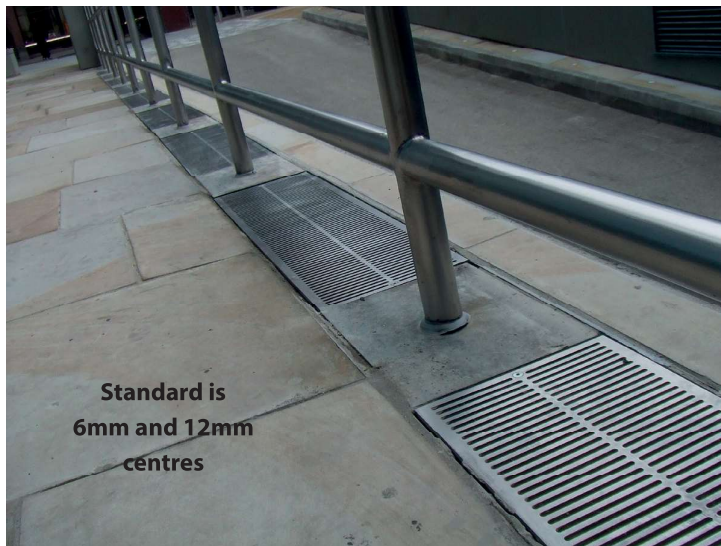
Standard is 6mm and 12mm centres

Specify: Kent Heelproof Slotted Grating KHPSG150; 150mm wide x 1000mm long x 4mm thick; Grade 304L Stainless Steel; Satin Finished; Load Class B See page 8 & 9 which shows how to create your own unique specification clause